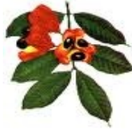
Ackee - national fruit of Jamaica It is poison unless eaten when ripe